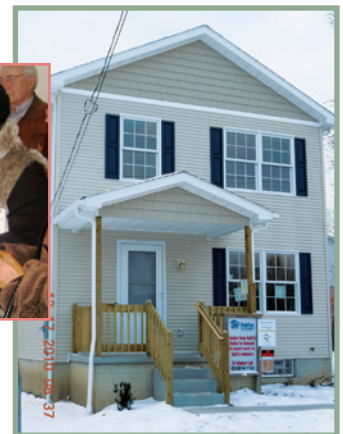
Our Habitat for Humanity House