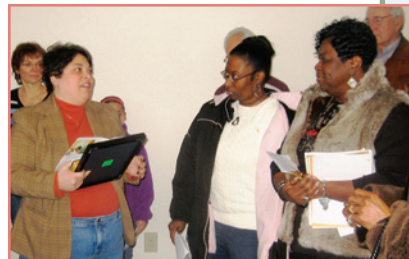
Dedication Ceremony with the homes proud new owners!