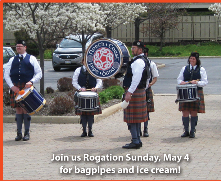
Join us Rogation Sunday, May 4 for bagpipes and ice cream!