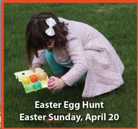
Easter Egg Hunt Easter Sunday, April 20