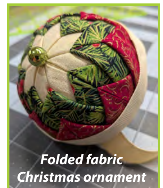
Folded fabric Christmas ornament