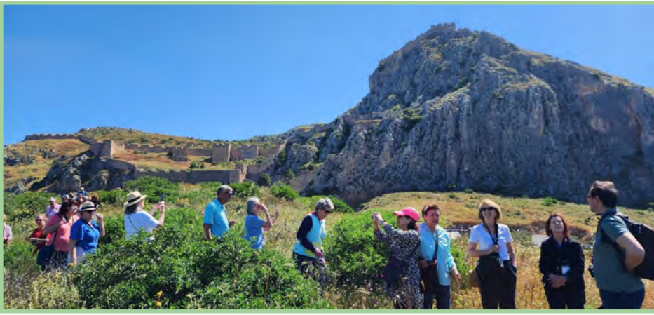
Pilgrims enjoy the vista overlooking Corinth with the Temple of Aphrodite in the background