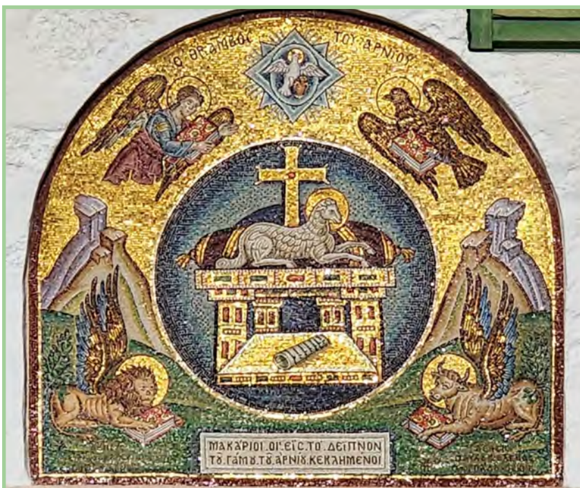
A mosaic of the Lamb who was slain from the Book of Revelation at the entrance to the Cave of the Apocalypse on the island of Patmos