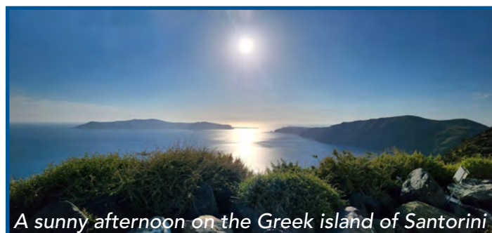
A sunny afternoon on the Greek island of Santorini