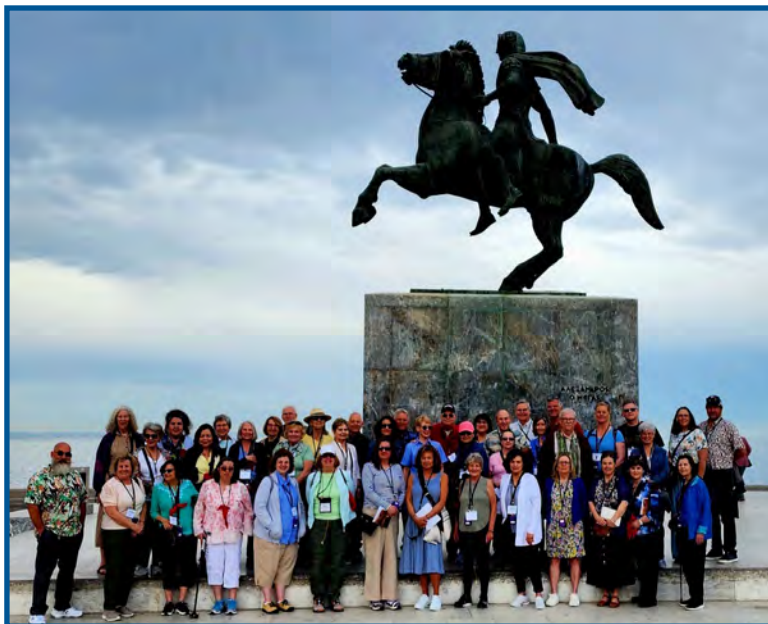
The pilgrims gather beneath a statue of Alexander the Great in Thessaloniki. Alexander, who died in 323BC, created a massive empire stretching from Thrace and Macedonia (northern Greece) to Egypt and the Indian peninsula in the Far East