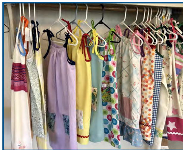
Sundresses made by St. Paul's members and friends at Mitzvah Day 2024