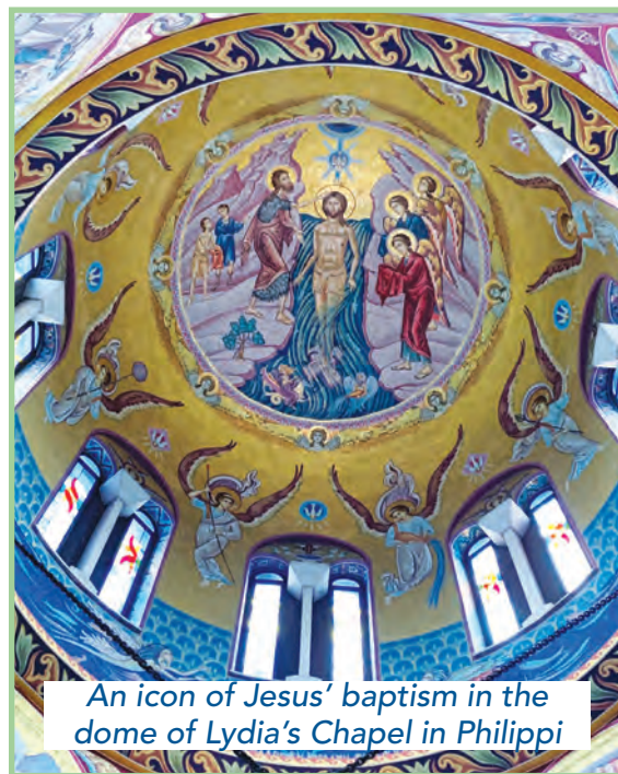
An icon of Jesus' baptism in the dome of Lydia's Chapel in Philippi