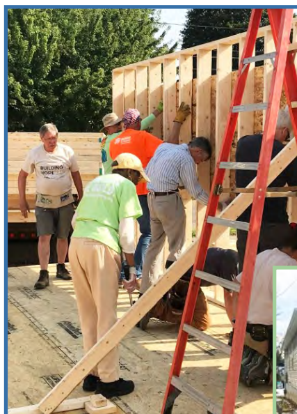
On Hollibaugh Ave., St. Paul's volunteers putting up exterior walls