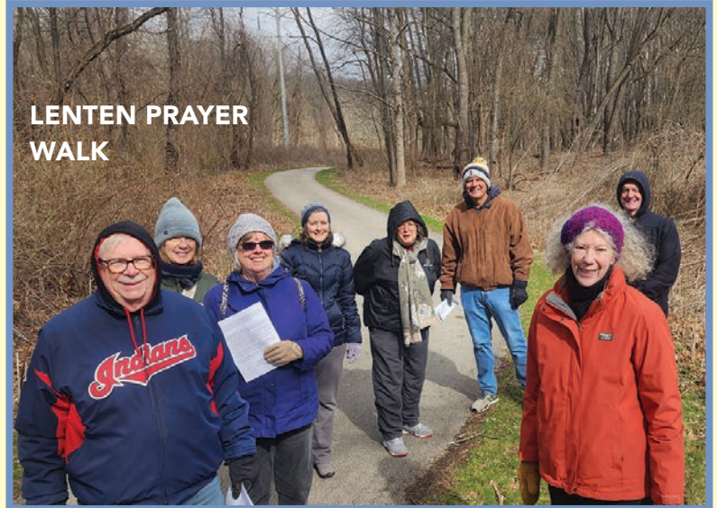
LENTEN PRAYER WALK