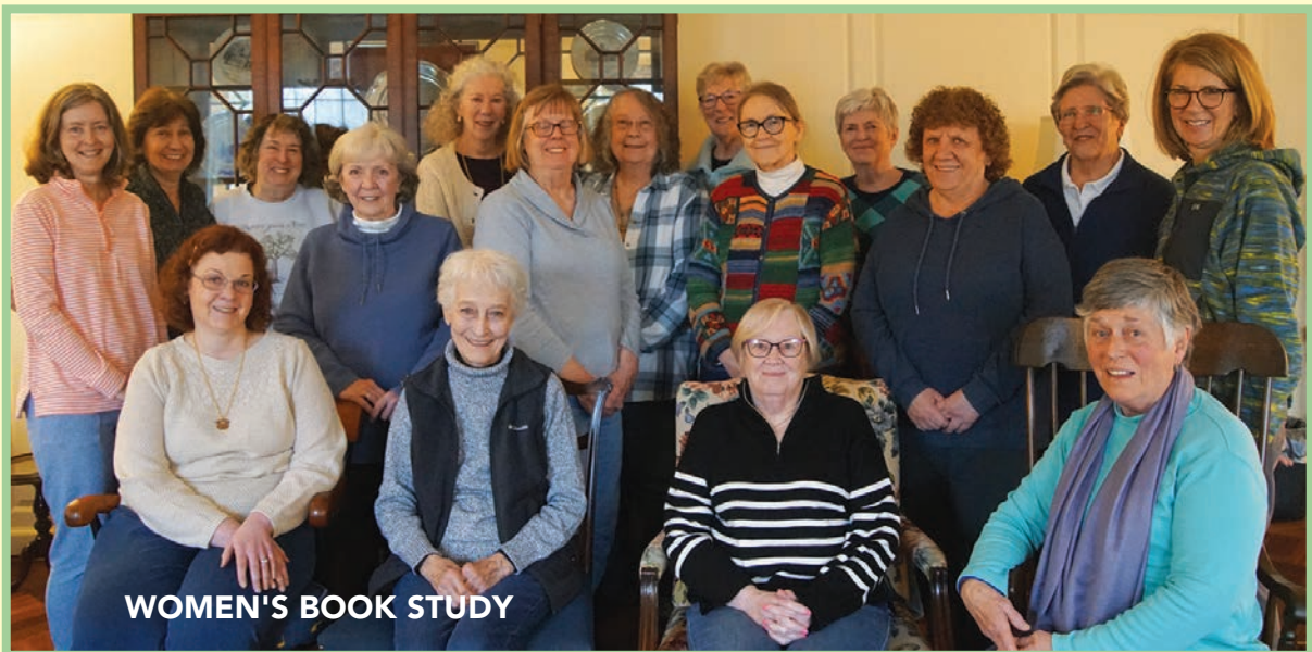
WOMEN'S BOOK STUDY

So many ways to get involved at St. Paul's!