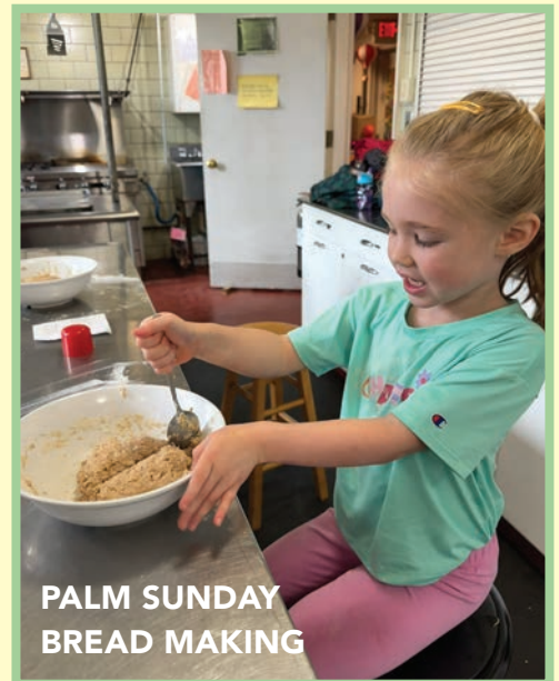
PALM SUNDAY BREAD MAKING

So many ways to get involved at St. Paul's!