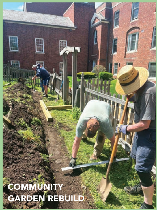
COMMUNITY GARDEN REBUILD