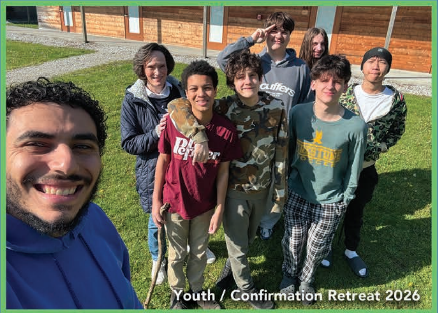
Youth / Confirmation Retreat 2026