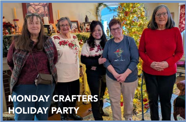
MONDAY CRAFTERS HOLIDAY PARTY